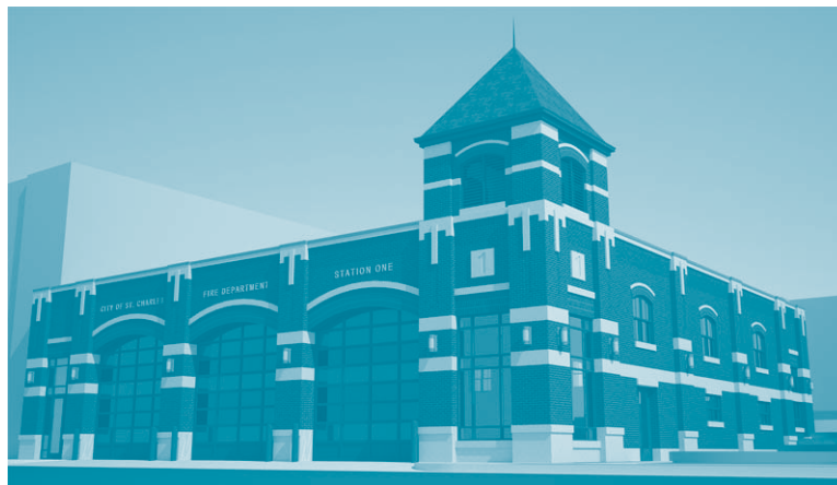
An artist rendering of the new Fire Station #1

Commuters are advised to watch for temporary road detours due to some modifications that will have to be made to First Avenue. Closures may also be required to facilitate the delivery of steel and other large materials but they should be infrequent and of short duration. A webcam will be installed on City Hall so that everyone may view progress on the City of St. Charles Website as the building takes shape. Watch for the Fire Station to open in July of 2009.